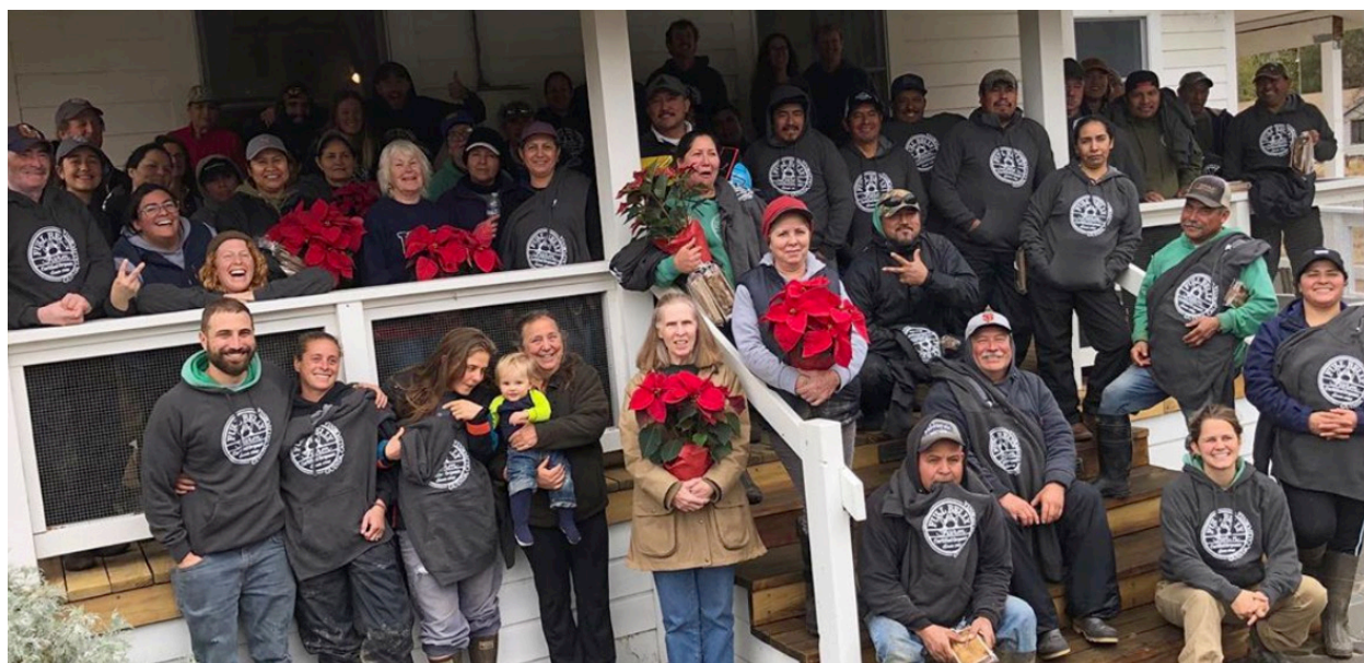
Staff and family gathering at Full Belly Farm