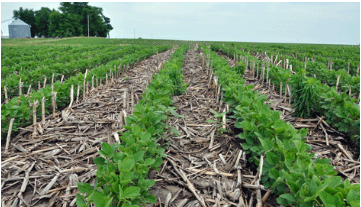
Example of low-till fields with harvest residue between the rows

With rising global temperatures, soil erosion from extreme precipitation and drought are expected to become more prevalent. One way that more and more farmers are adapting to a changing climate is to focus on their soils. Practices such as composting, crop rotation, and planting cover crops between seasons replenish and protect the soil. Low-till farming (which means reducing the extent soil is ploughed) helps to retain organic matter within the soil, which reduces the amount of carbon dioxide that is released into the atmosphere. These practices also help to attract and retain water, ensuring proper hydration for plants and soil organisms even during dry periods.