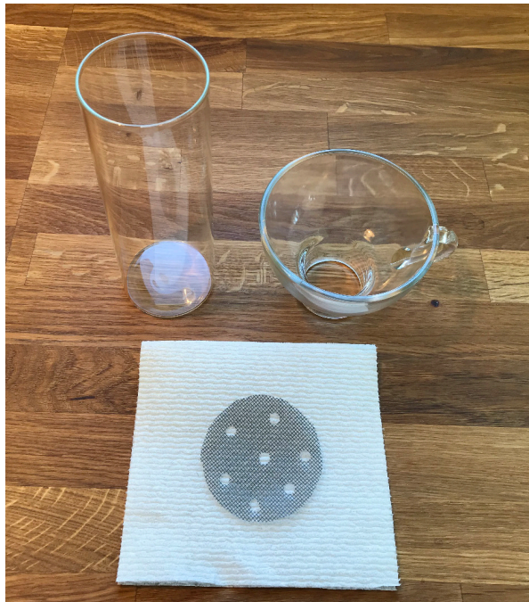
Example of setup with glass, funnel, paper towel, and screen with holes punched in it