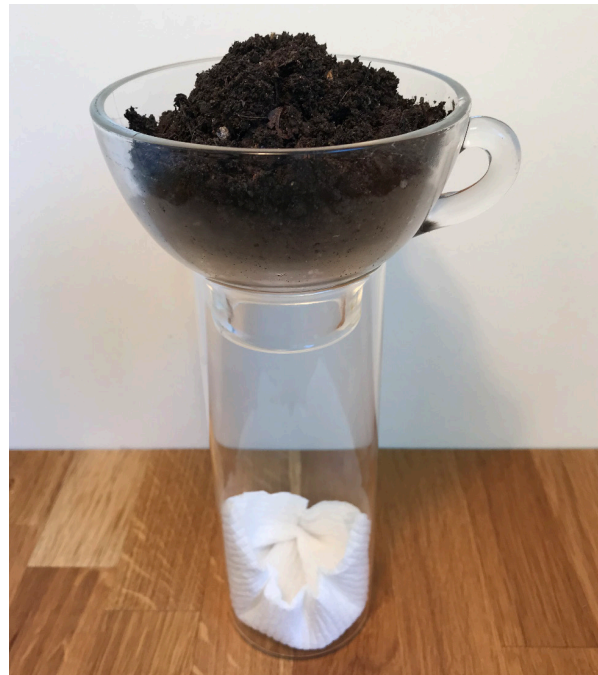
Glass, funnel, paper towel, and screen assembled with soil in funnel